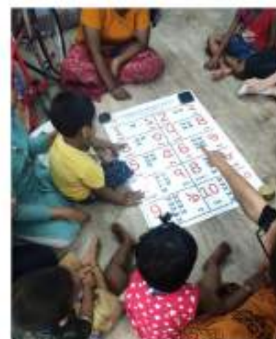
Learning shapes, colours, numbers at the same time. Movement session with the children