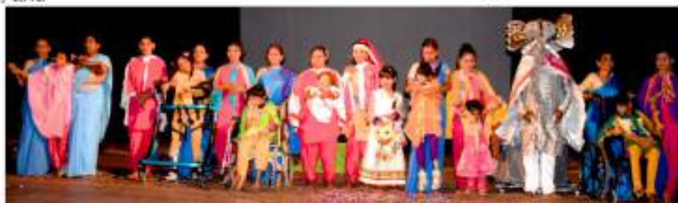
Inclusive performance at Aban Mahal, Kolkata. Special harnesses, walkers and wheelchairs were used for the children unable to move, stand, walk.