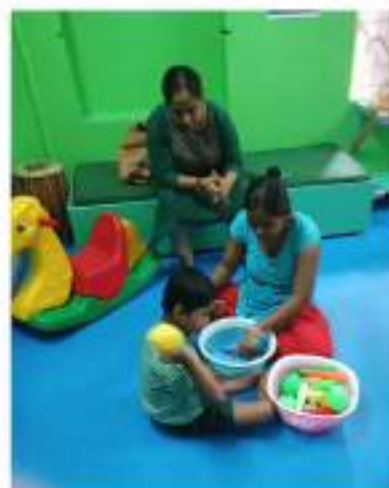
Special Educator with the mother of a special needs child