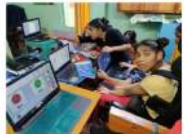
An ongoing online session