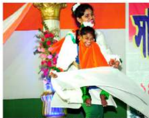
Sisters performing on Republic Day