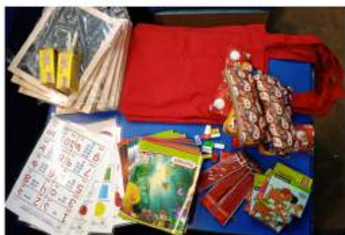
Children's Smart Centre providing study kit and study materials