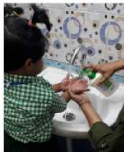
Learning shapes and colours, open to imagination, and hygienic habits