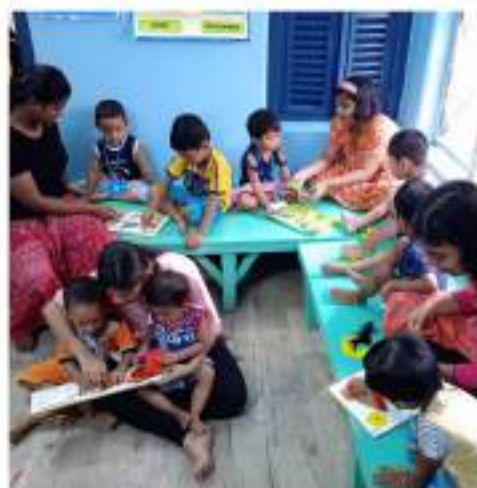
Lessons on sharing, caring, teamwork.