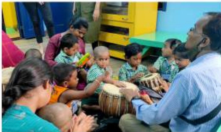
Rhythm class at Children's Smart Centre