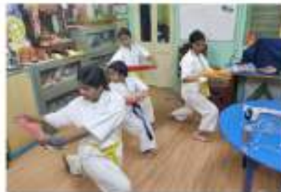
Karate class through online video instructions.