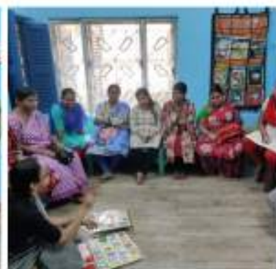
PTM at CSC

Children's Smart Centre was scheduled to open in April 2020 . Due to lockdown we had to postponed. Later in 2021 we started home visits with the study materials. After several pauses we were successful in opening the school in April 2022. Now we are running the school in the community.