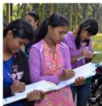
Taking notes at the Botanical Garden, Howrah

https://doi.org/10.1007/s10560-019-00633-8