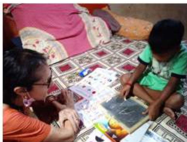
One of the student preparing the lesson