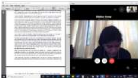
One of the girls reading Malgudi Days through Skype

The girls didn't suffer from isolation because they had each other like a family.