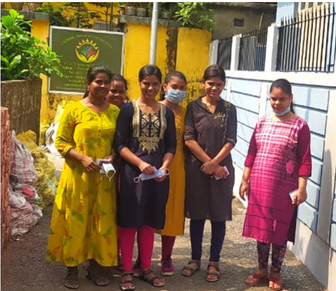
Heading out to the polling booth

West Bengal holds its State Assembly election every five years. This year some of our girls were eligible to vote. We had made sure that they already had the necessary paperwork for them to qualify for an Election Card. Voting rights are often ignored for children in institutional care. For most the care ends when the child turns 18. For the ones who can never be on their own we must provide lifetime care. The girls were really excited. As in many countries, exercising the freedom to vote is a Rite of Passage to adulthood and a symbol of pride.