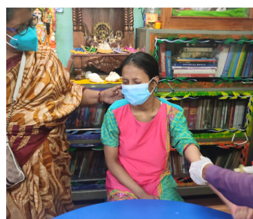
Getting the antibody test