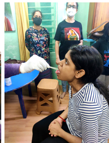
Getting the Covid Test