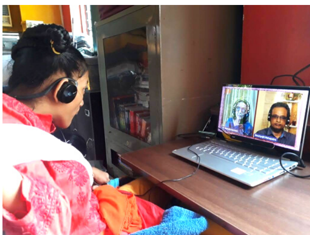
Ganga watched it separately, four more times.

Here is a link to the interview: https://www.youtube.com/watch?v=Dywx_G9lcUs