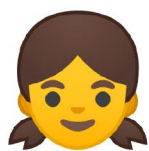
AVATAR 9 & 10