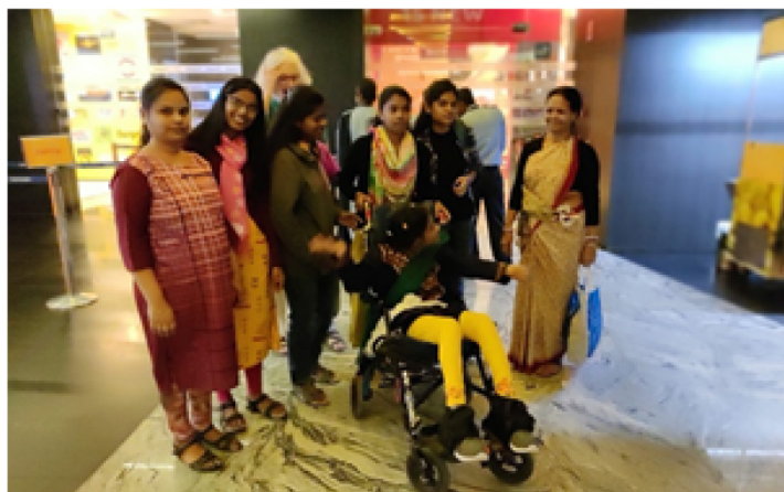
At the theater after watching the Hindi film, Panga.