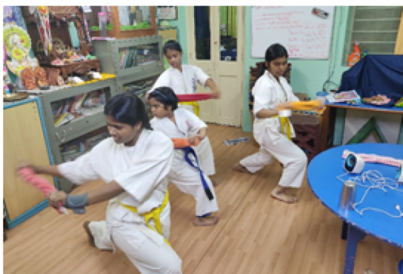
Karate class through online video instructions.

When talking about the meaning of family, a little girl once said to me, "Family means the people you share germs with." Never has that been more true because we all share germs. At this moment we are trying not to share a certain set of germs, but we understand we are all vulnerable. We are all family; none of us is immune. So, Shishur Sevay wants to share with our friends, family, supporters how we are weathering this pandemic. India is on lockdown, total lockdown until 15 April. If you go on the street you will be confronted by police demanding to know why you are out of your home. But we are fine. Teachers are giving classes online; everyone is doing what they can from home. The massis/caretakers are staying here. I am taking up the slack and spending time with the children. Thank you for caring.