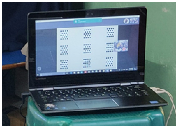
Sharing a Subitizing image through skype

The girls have managed the technology for the classes including and also do some basic troubleshooting. When problems have occurred they worked via teacher instructions and screen sharing. For the past three years they have all been in a weekly computer class.