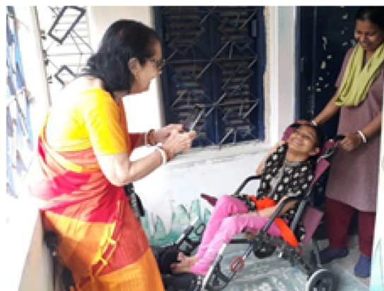
Ganga checks out the centre before the painting begins

The opening was planned for first week of April with classes starting mid-April but that has been postponed for now, because of the Covid-19 pandemic. More on the lockdown later.