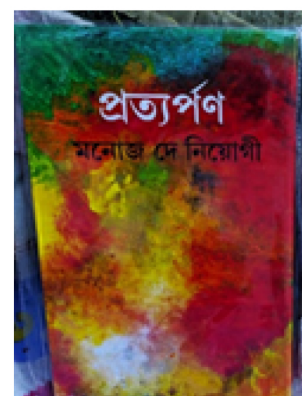
The book cover with her art