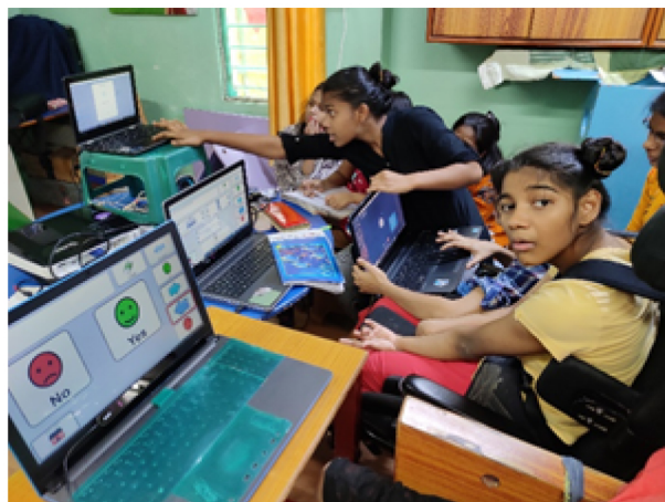
An ongoing online session