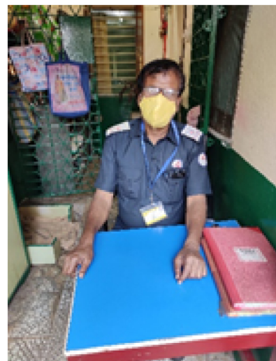
Our guard wearing a mask