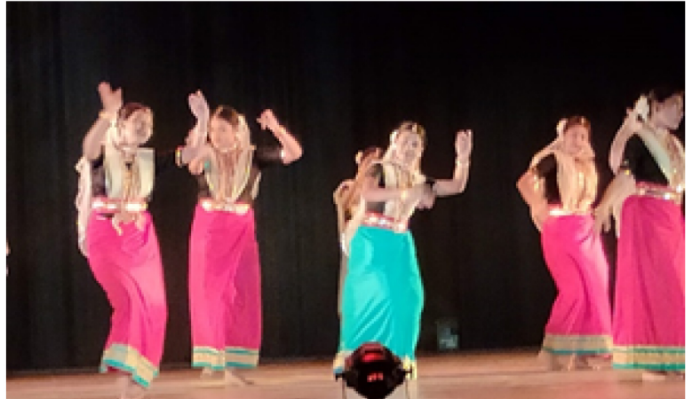
One of our girls taking centre stage in the performance