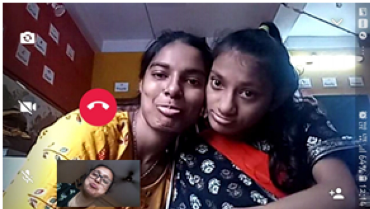
On a whatsapp video call with one of the teachers